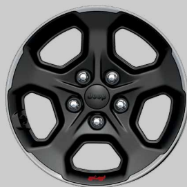
WFJ - 17-Inch Granite Crystal Alloy Wheels (Standard on Rubicon)