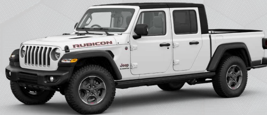
PW7 - Bright White (Standard)