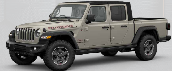
PUA - Gobi (Option)