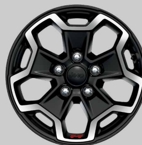
WFN - 17-Inch Polished Black Alloy Wheels (Option on Rubicon)