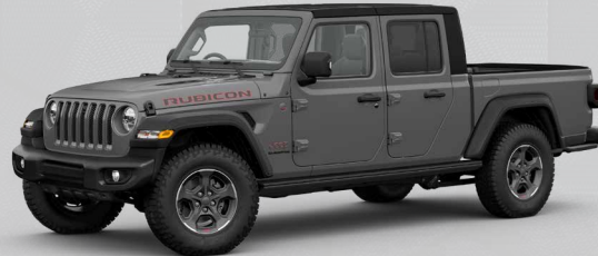
PDN - Sting Grey (Option)