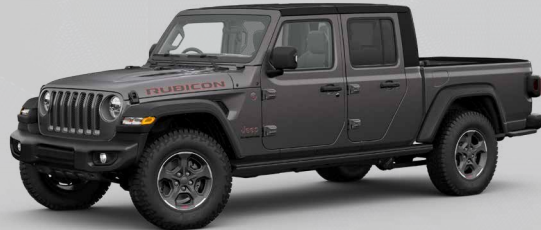
PAU - Granite Crystal (Option)