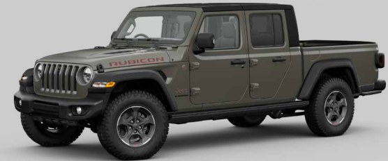
PGV - Gator (Option)