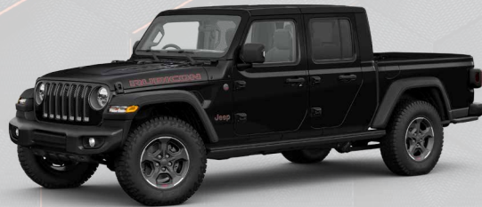
PX8 - Black (Standard)