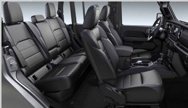
MLX9 - Black McKinley Leather with Overland Logo (Standard - Overland)