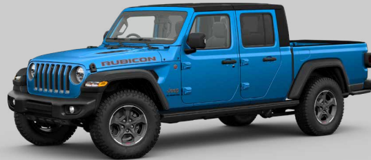
PBJ - Hydro Blue (Option)