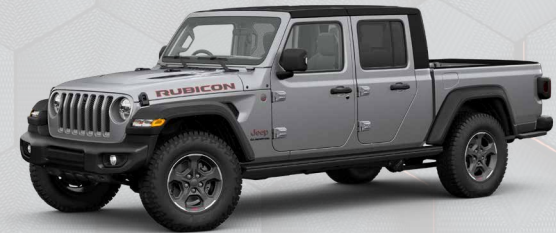
PSC - Billet Silver (Option)