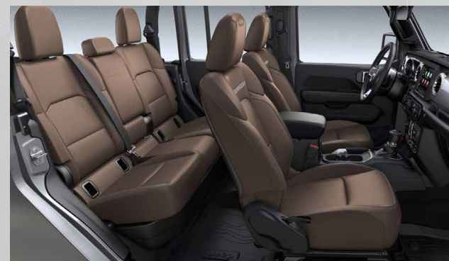
ALTV - Dark Saddle Leather Trimmed Bucket Seats (Option - Rubicon)