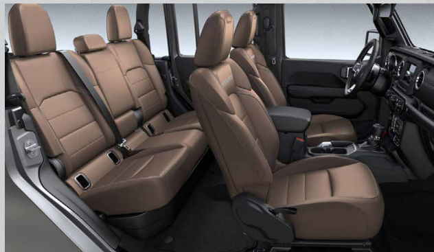
MLTV - Black/Dark Saddle McKinley Leather with Overland Logo (Option - Overland)