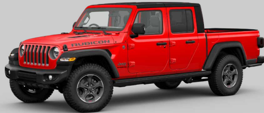
PRC - Firecracker Red (Option)