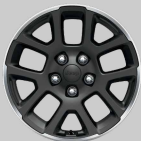
WPT - 18-Inch Granite Crystal Alloy Wheels (Standard on Overland)