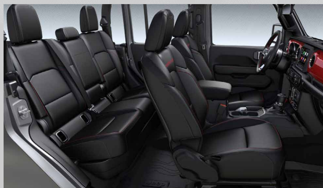
ALX9 - Black Leather Trimmed Bucket Seats (Option - Rubicon)