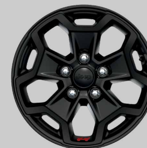
WBG - 17-Inch Black Alloy Wheels (Standard on Launch Edition)