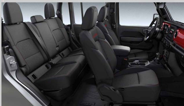
D5X9 - Black Premium Cloth Low-Back Bucket Seats (Standard - Rubicon)