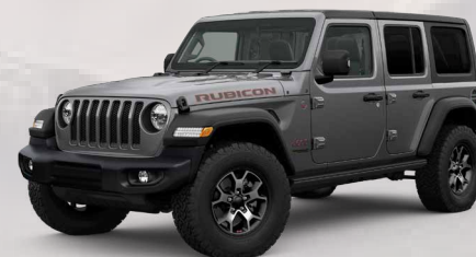
PAU - Granite Crystal (Option)