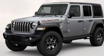
PSC - Billet Silver (Option)