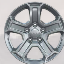
WF9 - 17-Inch Tech Silver Alloy Wheels (Option on Sport S)