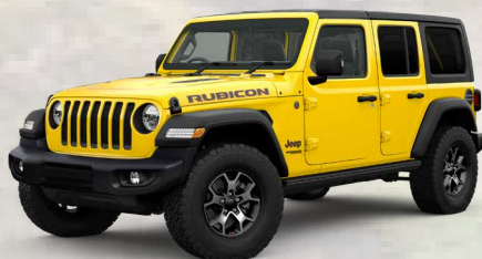
PYV - HellaYella (Option)