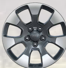
WPT - 18-Inch Tech Gray Polished Face Wheels (Standard on Overland)