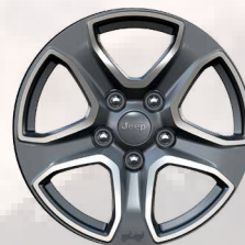
WBG - 17-Inch Polished Granite Crystal Wheels (Standard on Sport S)