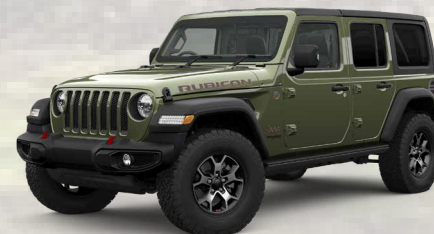
PGG - Sarge (Option)