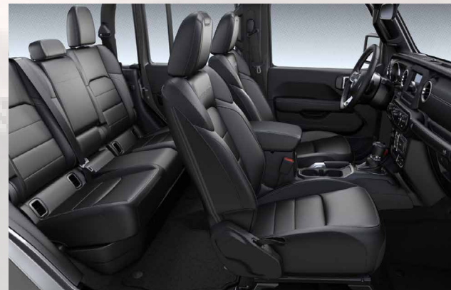
MLX9 - Black McKinley Leather with Overland Logo (Standard - Overland)