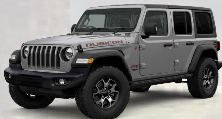
PDN - Sting Grey (Option)