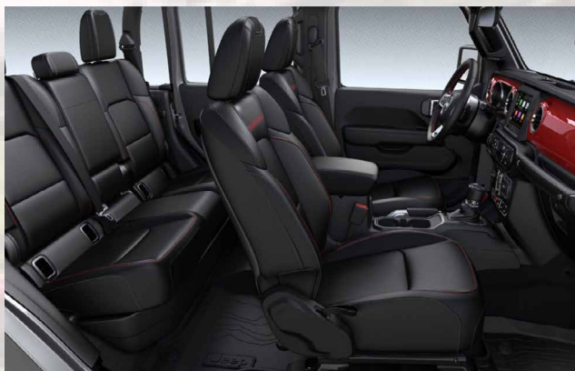
ALX9 - Black Leather Trimmed Bucket Seat (Option - Rubicon)