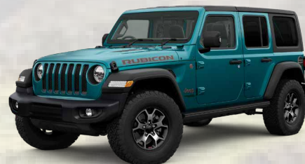
PPT - Bikini (Option)