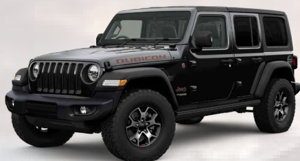
PX8 - Black (Standard)