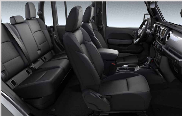
A7X9 - Black Cloth (Standard - Sport S)