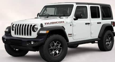
PW7 - Bright White (Standard)