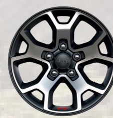
WGM - 17-Inch Polished Wheels with Black Pockets (Standard on Rubicon)