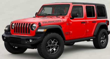
PRC - Firecracker Red (Option)