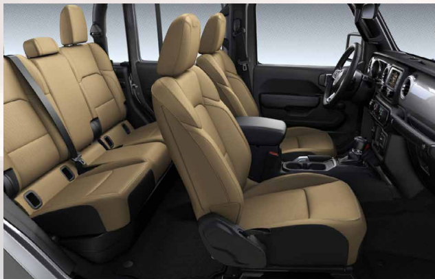
A7T5 - Black/Heritage Tan Cloth (Option - Sport S)