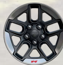
WGR - 17-Inch Black Wheels with Polished Lip (Option on Rubicon)