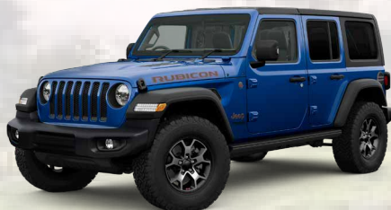
PBM - Ocean Blue Metallic (Option)