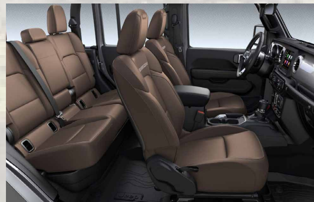
ALTV - Dark Saddle Leather Trimmed Bucket Seats (Option - Rubicon)