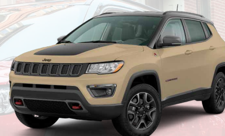
PTA - Mojave Sand (Option)