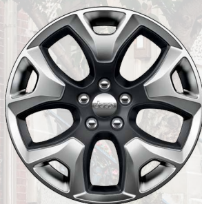
WPR - 18-Inch Alloy Wheels (Standard on Limited)