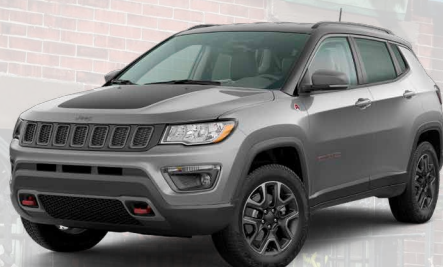
PAF - Minimal Grey (Option)