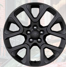
WPX - 19-Inch Alloy Wheels (Standard on S-Limited)