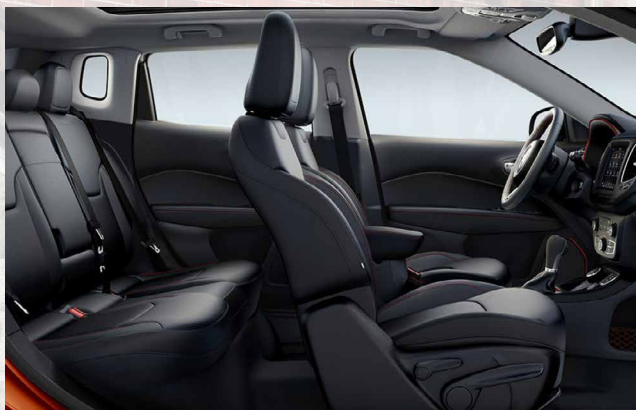
TLXC - Leather, Non-Vented - Black with Ruby Red Accents (Standard - Trailhawk)