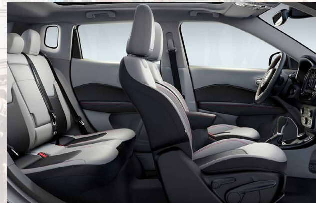
ALXS - Perforated, Non-Vented Leather - Ski Grey (Option - Limited)