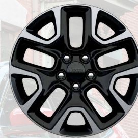
WD5 - 17-Inch Off-road Alloy Wheels (Standard on Trailhawk)