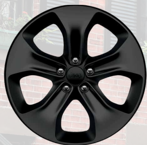
WP7 - 18-Inch Alloy Wheels (Standard on Night Eagle)