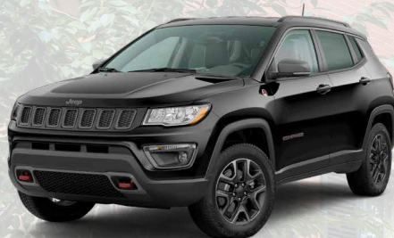
PXR - Brilliant Black (Option)