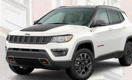
PW6 - Vocal White (Option)