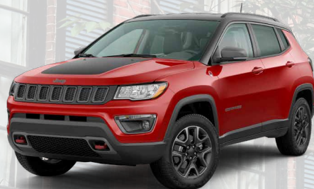
PRX - Colorado Red (Standard)