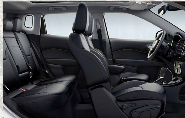
ALX9 - Perforated, Non-Vented Leather - Black (Standard - Limited & S-Limited)