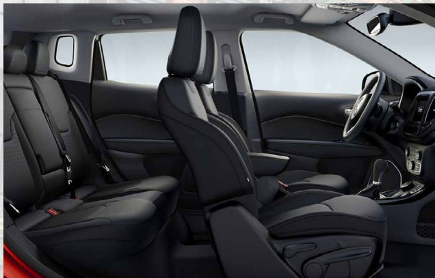
G7X9 - Cloth/Vinyl Low-Back Seats - Black (Standard - Night Eagle)