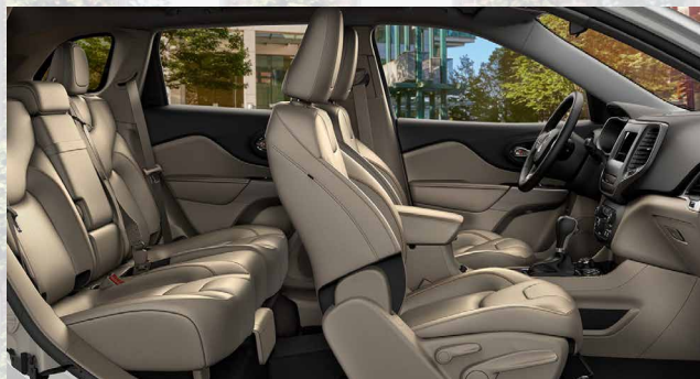
S5XL - Black & Light Frost Beige Cloth (Option on Sport)