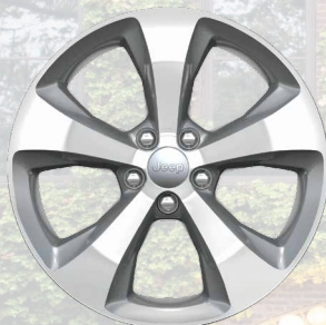
WPD - 18-Inch Satin Chrome Painted Alloy Wheels (Standard on Limited)