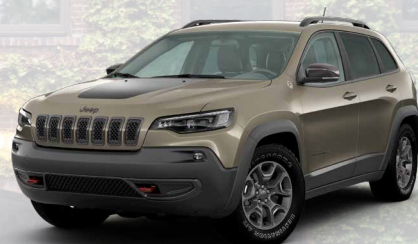
PT6 - Light Brownstone (Option)