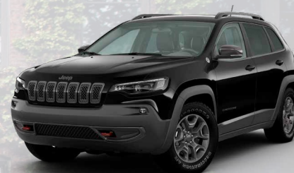
PXJ - Diamond Black (Option)