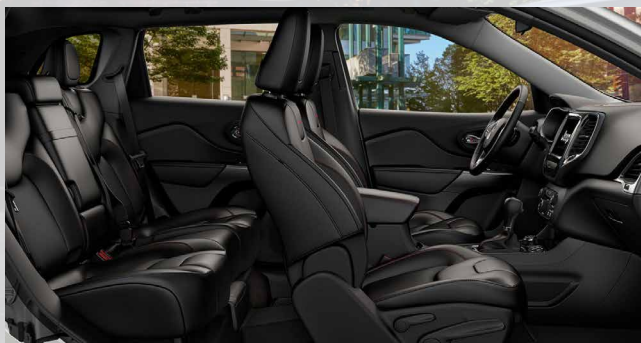
BLX9 - Black Leather with Red Accent Stitch (Standard on Trailhawk)