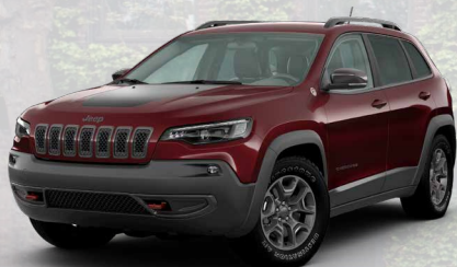
PRV - Velvet Red (Option)