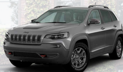
PSC - Billet Silver (Option)