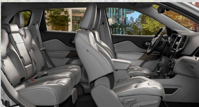
DLXS - Black & Ski Grey Leather (Option on Limited)