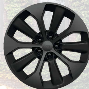
WPX - 19-Inch Granite Crystal Alloy Wheels (Standard on S-Limited)