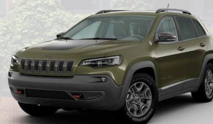
PFP - Olive Green (Option)