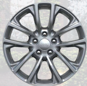
WFM - 17-Inch Alloy Wheels (Standard on Sport)

Option (O) Standard (S) Not Available (-) Not Available With (NAW)