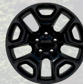
WBG - 17-Inch Black Painted Alloy Wheels (Option on Trailhawk with Trailhawk Premium Package)