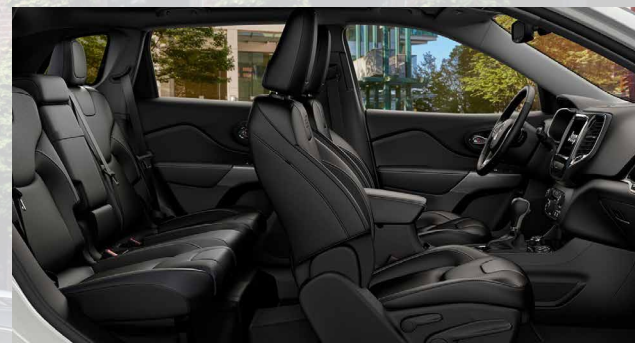
DLX9 - Black Leather with Tungsten Accent Stitch (Standard on S-Limited)