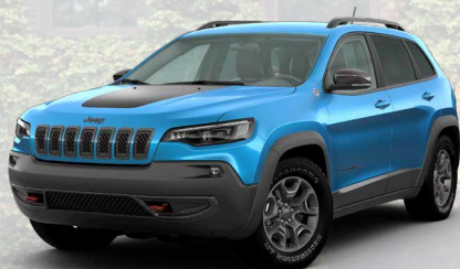
PBJ - Hydro Blue (Option)